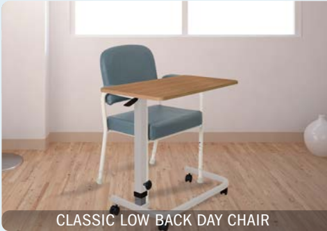
CLASSIC LOW BACK DAY CHAIR