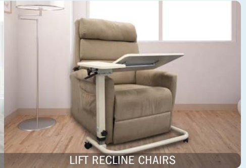
LIFT RECLINE CHAIRS