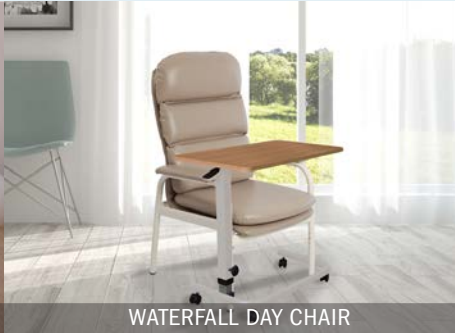
WATERFALL DAY CHAIR